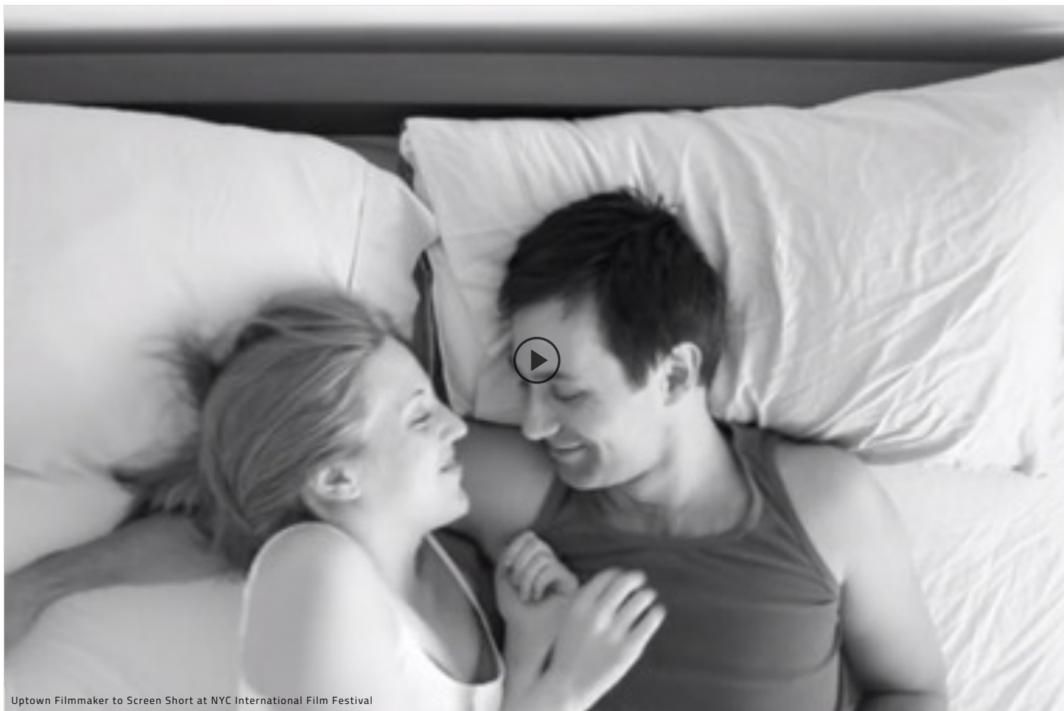
Uptown Filmmaker to Screen Short at NYC International Film Festival